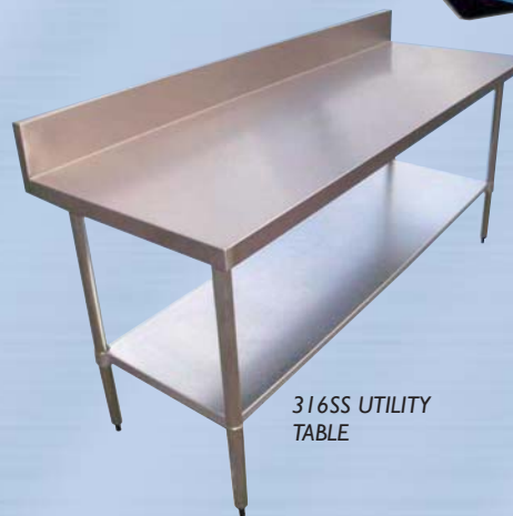
316SS UTILITY TABLE