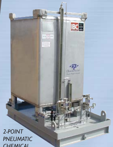
2-POINT PNEUMATIC CHEMICAL INJECTION PACKAGE WITH 550 GALLON TANK