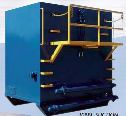
30BBL SUCTION TANK