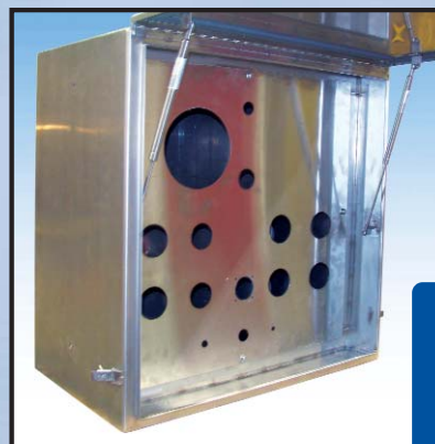
WEATHERPROOF 316SS ENCLOSURE