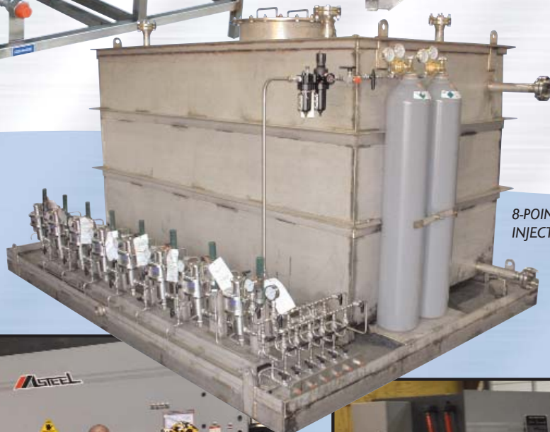
8-POINT PNEUMATIC CHEMICAL INJECTION PACKAGE WITH TANK